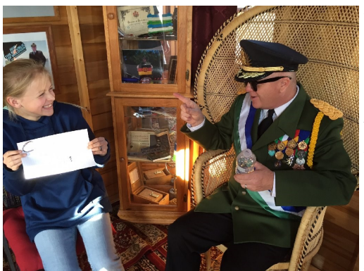
A Rejected Bribe!

Molossia is a happy dictatorship and nothing aids in that happiness more than a happy dictator and happy citizens. Sunday, 20 March 2016 XXXIX was our first annual Bribe Day, a day set aside for Molossia's citizens to bribe The President for things that they want. A time-honored tradition in autocracies around the world, bribery and malfeasance have been decidedly lacking in Molossia in the past. This was remedied on a breezy afternoon in the Office of the President. Various Mo-