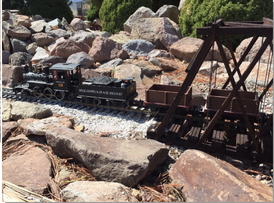
Zephyr Crossing The Bridge