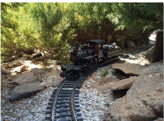
Zephyr Under The Trees