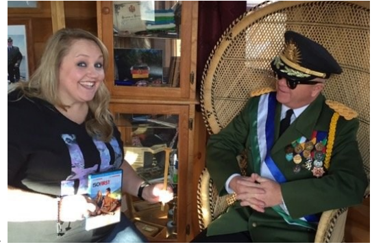
The First Lady's Bribe!

lossians lined up to meet with His Excellency and to bribe him for favors. Some bribes were accepted, such a back-scratching from The First Lady in return for watching an Adam Sandler mov-