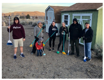
Ready to Play!

Let's face it, we Molossians aren't a real athletic bunch. But when the mood strikes us, we take up brooms and head out to play broomball. Sure, there's broomball such as is played on ice 'way up north in the Cheese States (as His Excellency calls them). But none of that sissy messing about on ice stuff for us Molossians! Here, we have brooms, we have a ball and we have a rock strewn dirt patch called the Alphonse Simms Memorial Cosmodrome and Broomball Field. On this dusty sward we valiantly whack that poor ball back and forth and spend enormous amounts of time retrieving it from the surrounding sagebrush. Eventually we tire of this and call it a game. Rules? None actually. If you want to have two teams, three teams, no teams, switch teams (if there are any) mid-game, have goals, have no goals, have sword fights with the brooms - anything goes. But above all the main goal is to have fun!