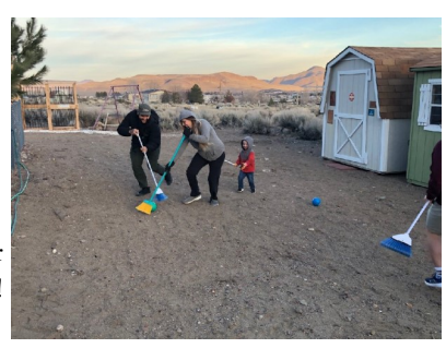
Battle for the Ball!