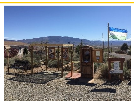
Molossia's Customs Office and Welcome Center

Passports not required for entry into Molossia from the United States. Passports are, however, recommended and will be stamped upon entry. There are no visa requirements for entry into Molossia. Please note, for visitors wishing to visit Molossia from outside the United States, there may be visa requirements to enter the United States. The Molossian Government cannot assist in obtaining visas to enter the United States.