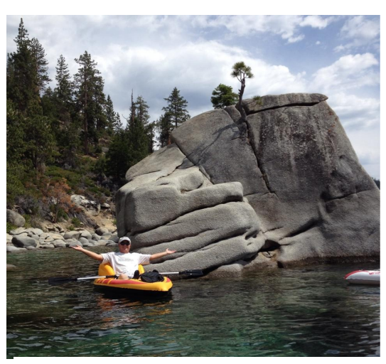
His Excellency, The President aboard the M.S. Bandicoot, during a Naval Expedition to Bonsai Rock in Lake Tahoe, 12 July 2014 XXXVII.