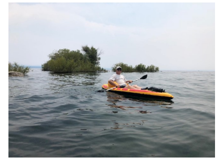
The President Afloat

On Sunday, 22 July 2018 XLI the Molossian Navy deployed to nearby Lake Tahoe, a favored spot for the Navy's many voyages of discovery. The target this time was at the north end of the lake near Tahoe City, a secluded beach area called Lake Forest. The Navy has never explored this area of Lake Tahoe before, so this voyage was to cover new ground - or water, rather. Arriving at about 11:00 AM MST, the Navy deployed immediately onto the lake, and quickly set as its destination a copse of semi-submerged willows not far off shore. Upon arriving at the bushy atoll it was discovered that the brush and trees hid a tiny island, a marshy islet reminiscent of a mangrove swamp in the American south. The President and Chief Constable went ashore to explore the mysterious islet, a brief foray considering the small size of the island. The duo then returned to the rest of the fleet and completed a circumnavigation of the islet before voyaging further afield in the vicinity. After navigating adjacent waters and practicing deeper water boarding, the Navy eventually returned to shore, mission complete. The fleet then returned to Molossia, another successful mission for the Mighty Molossian Navy!