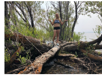
The Chief Constable Exploring