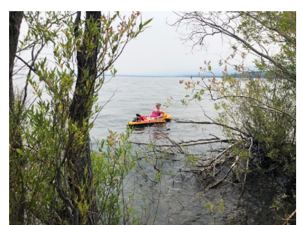
The First Lady Circumnavigating