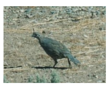
National Bird: Valley Quail (Lophortyx californica)

THE NATIONAL ARMS: The Greater National Arms of the Republic of Molossia consists of a shield, divided into three equal bars in the National Colors, blue, white and green. The shield is trimmed in blue and white, with a mustang, the State Animal, rampant, centered upon it. The shield is centered on a gold sunburst, symbolizing the setting sun, and the far west where Molossia is located. The sunburst is topped with a crown, hearkening to Molossia's origin as a kingdom, and three plumes in blue, white and green. A banner with the word "Molossia" is centered beneath the shield.