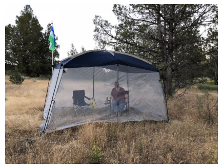
Farfalla Evening By The Flag