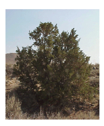
National Tree: National Flower: Common Juniper Common Sagebrush (Juniperis communis) (Artemisia tridentata)