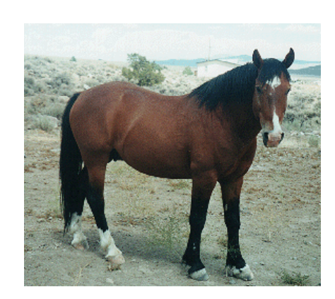
National Animal: Mustang (Wild Horse) (Equus caballus)