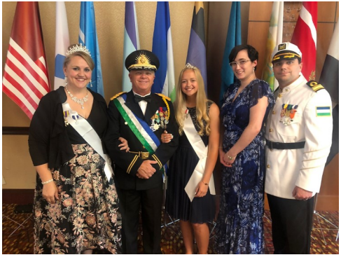
Molossians At The Gala