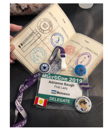
Molossian Passport and Badge.