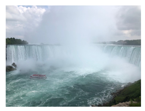
Niagara Falls, Visited by the First Family during their trip to Canada for MicroCon