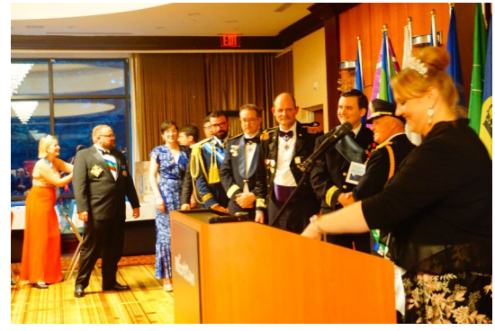
The President Giving Out Medals.