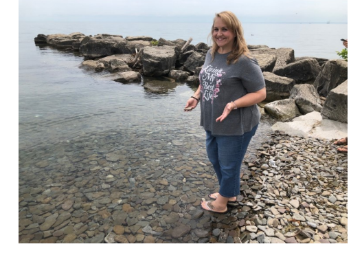
The First Lady at Lake Ontario