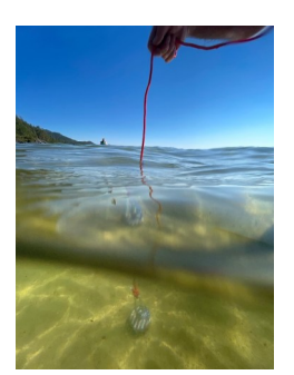
Beneath the Waves