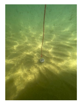
Searching for Treasure