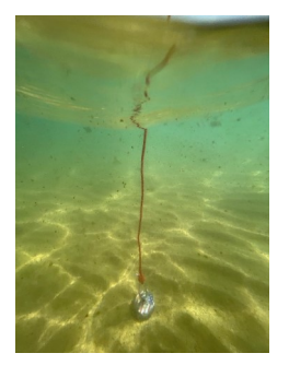
On the Bottom