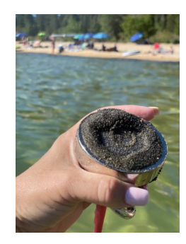
Trove of Iron Filings