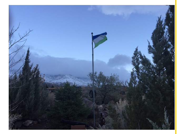
Snow In The Mountains Tells Us Winter Has Arrived In Molossia!