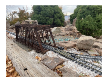
Bridge Across the New River