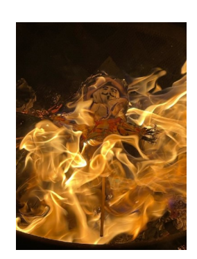
Guy On Fire