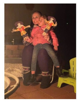
The First Lady and Lily's Guys