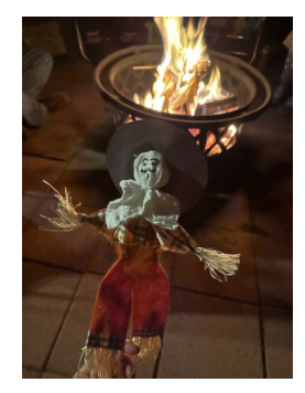
Guy Ready For The Fire