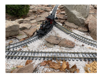
No. 18 "Zephyr" at the new North Wye