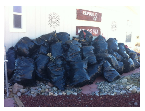
Tons of weeds ready for export to the US.