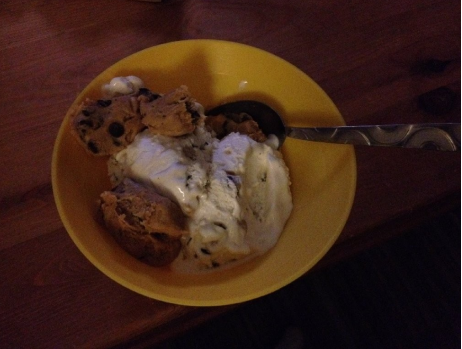
A bowl of deliciousness!