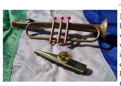
Types of Molossaphones.

http://www.molossia.org/radiomolossia.html