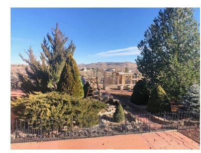
Trimming Trees Down

Norton Park is the garden spot of Molossia, an oasis of green in our sere desert land. It is home to the Molossia Railroad and hosts verdant grapes, colorful roses and towering pine trees. However, lately two trees became a nuisance of sorts and unfortunately had to be removed. The two junipers - originally thought to be a small variety when planted - instead grew to mammoth size, dominating the Molossia Railroad, blocking paths and threatening the national sanitation system. Thus it was determined that the junipers had to go. Over a period of two weekends, interrupted by foul winter weather, first one, then the second tree were toppled. The process was laborious, involving chopping, digging and even winching the trees from the ground. Finally, after much travail, the junipers fell and are now no more. In their place will instead be planted two Dwarf Alberta Spruce trees, a kind of miniature pine that will be more manageable in the small confines of the Park. Norton Park will bloom again in spring and no longer will the massive junipers spoil the tranquil beauty of the garden spot of Molossia.