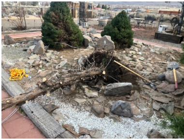
First Tree Down