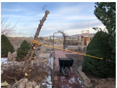
Winching the Second Tree