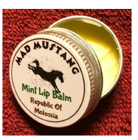
Peppermint Lip Balm

The Government of the Republic of Molossia is proud to introduce our latest export product, Mad Mustang Lip Balm. Made with the finest ingredients, and coming in two flavors, Lemon and Peppermint, Mad Mustang Lip Balm is ideal for invigorating your tired, chapped lips. Here in Molossia our dry desert climate saps the moisture from everything and none more than lips. Our scientists have labored long and hard to develop a special formula that will withstand our harsh desert sun and keep your lips soft and healthy. So don't wait, buy Mad Mustang Lip Balm today and get the most beautiful lips in the country!