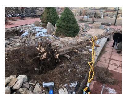
Second Tree Down