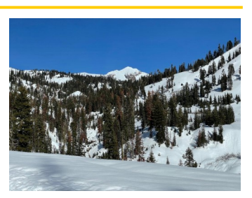
Lassen Peak Looms Over the Winter Landscape