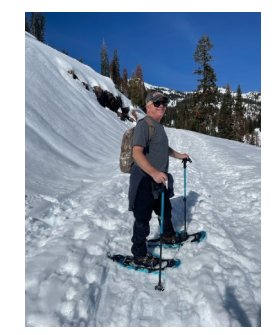
The President on the Trail