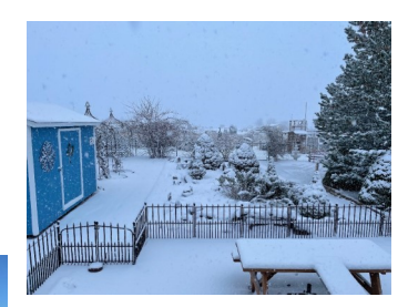
Snow Piling Up