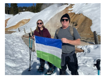
The Flag at the Sulfur Works