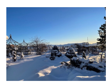
Snow in Norton Park