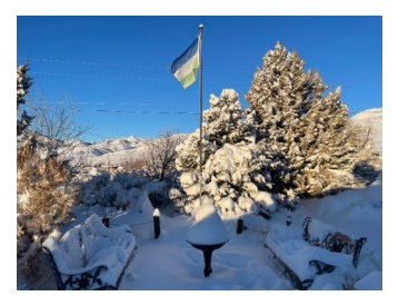
Snow in Republic Square

The winter season usually begins around the last weekend of November, with the first light snowfall almost invariably falling at that time. This winter neither snow nor much rain fell through November and December (precluding a white Christmas), with winter reserving its force until January. January and February are the real winter months in Molossia, with frequent snowfalls and cold temperatures being the rule. Occasional warm spells occur, especially in February and March, called "false spring", followed by the real spring in April. So now that winter has finally arrived, it is certain that more will come!