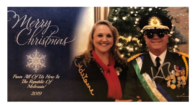
The 2019 Presidential Christmas Card.