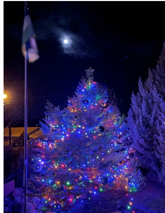
The National Christmas Tree in Republic Square