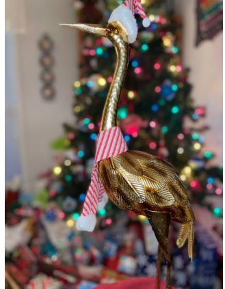
Molossia's Traditional Christmas Crane, Decorated for the Holiday.