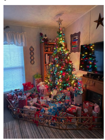
The National Christmas Tree in Government House

Christmas is a major holiday in Molossia and a time of great tradition as well as festivity. Christmas is one of the most important holidays in the Republic of Molossia, and is traditionally a three-day celebration. The holiday actually begins on December 24th with Christmas Eve activities, including watching movies, baking (and eating) cookies, drinking eggnog and playing board games as a family - and the tradition of decorating Molossia's Christmas Crane. Christmas Eve dinner consisted this year of our traditional meal of lasagna, reflecting the Italian heritage of Molossia. The evening ends with the reading of the "Night Before Christmas", and with tracking the arrival of Santa Claus using NORAD's website. Christmas morning, December 25th, begins early, as the family descends upon the hoard of presents beneath the National Christmas Tree. Once the frenzy of present-opening ends, Christmas