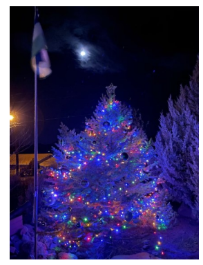
The National Christmas Tree In Republic Square.