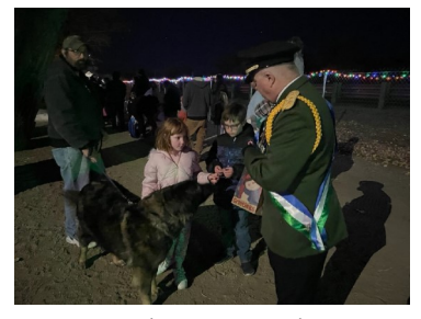
Passing Out Candy Canes