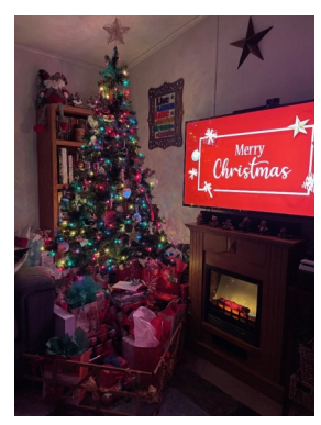
The National Christmas Tree Inside Government House.