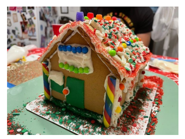
Festive Molossian Gingerbread House