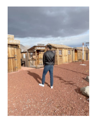
Could it be? Seen in Molossia, JFK Jr, long-deceased Kennedy scion and QAnonicon. It's not Dealey Plaza but could it be true?

15 December was Zamenhof Day, celebrating Esperanto, the second language of Molossia. Esperanto is a constructed international auxiliary language, created by L. L. Zamenhof in the 19th century, with over 2 million speakers (including a small group of native speakers). It is meant for communication between people from different nations who do not share a common first language. It is used throughout Molossia, so look for signs in Esperanto when visiting our nation!