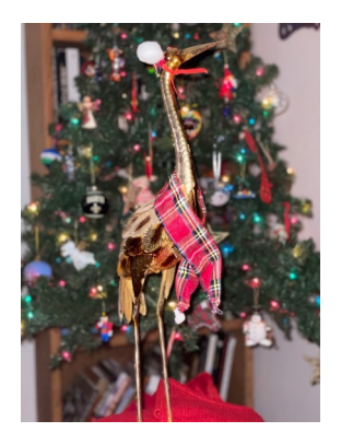
Molossia's Traditional Christmas Crane, Decorated for the Holiday.