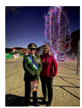
Festive First Couple