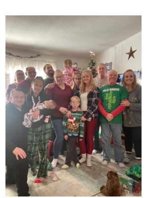
The Molossian Family Gathered for the Holiday.

Christmas is a major holiday in Molossia and a time of great tradition as well as festivity. Traditionally a three-day celebration, the holiday actually began on December 24th with a big Molossian family gathering. Molossians gathered from miles around in Government House to exchange gifts and engage in family revelry. Christmas Eve dinner consisted this year of a wide variety of snacks and goodies and Christmas Eve activities including watching Christmas movies, baking (and eating) cookies and other treats, and drinking eggnog. The evening ended with the reading of the "Night Before Christmas", a Molossian tradition. Christmas morning, December 25th, began early, as the family descended upon the pile of presents beneath the National Christmas Tree. Once the present-opening ended, Christmas breakfast was made and served, and afterward the family headed out from our nation to the US, to watch a movie and enjoy a Christmas dinner over the border. Boxing Day is on December 26th, and is the last day of the Christmas holidays. While no special events usually take place, dinner on Boxing Day this year was spaghetti, in keeping with Molossia's Italian heritage. This wrapped up the Christmas events for the year, with everyone eagerly looking forward to the distant arrival of next year's Christmas.