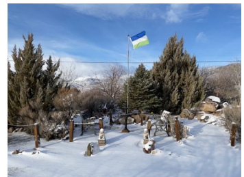
A White Christmas in Republic Square.

Christmas is a major holiday in Molossia and a time of great tradition as well as festivity. Traditionally a three-day celebration, the holiday actually began on December 24th with a big Molossian family gathering. Molossians gathered from miles around in Government House to exchange gifts and engage in family revelry. Christmas Eve dinner consisted this year of a wide variety of snacks and goodies and Christmas Eve activities including watching Christmas movies, baking (and eating) cookies and other treats, and drinking eggnog. The evening ended with the reading of the "Night Before Christmas", a Molossian tradition. Christmas morning, December 25th, began early, as the family descended upon the pile of presents beneath the National Christmas Tree. Once the present-opening ended, Christmas breakfast was made and served, and afterward the family headed out from our nation to the US, to watch a movie and enjoy a Christmas dinner over the border. Boxing Day is on December 26th, and is the last day of the Christmas holidays. While no special events usually take place, dinner on Boxing Day this year was spaghetti, in keeping with Molossia's Italian heritage. This wrapped up the Christmas events for the year, with everyone eagerly looking forward to the distant arrival of next year's Christmas.