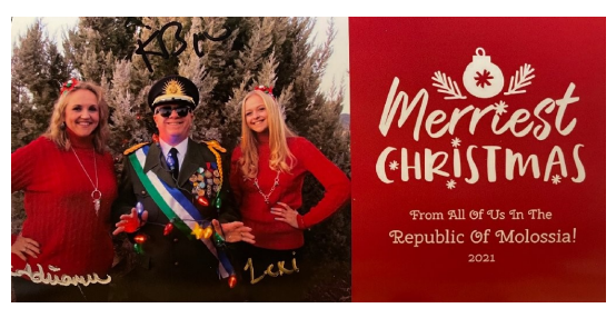
Molossia's Annual Christmas Card.