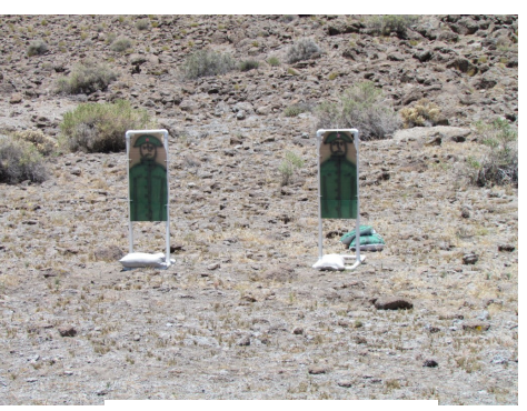
East German Targets