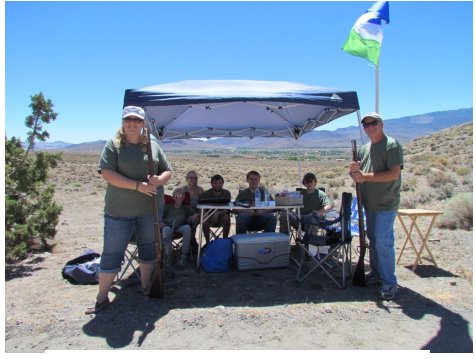
Weapons Practice Camp

On Sunday, 29 June 2014 XXXVII the Molossian Naval Infantry engaged in weapons training to improve their overall state of readiness. On a warm summer day the Naval Infantry set out for their rifle range in the foothills of the nearby Molossian Alps. Setting up on a dusty hillside, they began with archery practice, using the Chief Constable's compound bow. Following that the Naval Infantry practiced bayonet charges against practice dummies resembling East German soldiers. Next, the troops participated in weapons training and target practice. The weapons used were Pattern 1853 Enfield Rifle Muskets, the standard firearm of our Naval Infantry. The Enfield is a muzzle-loaded, black powder rifle, that fires a .58 caliber bullet; it can be complex to use for the uninitiated. Nevertheless our troops quickly gained proficiency in the weapon, hitting their targets accurately every time. After several hours, the Naval Infantry as a whole was considered to be accomplished in the use of their weapons and the training mission was declared a success. We are proud of our troops and are confident in their ability to defend our homeland with ease and skill.