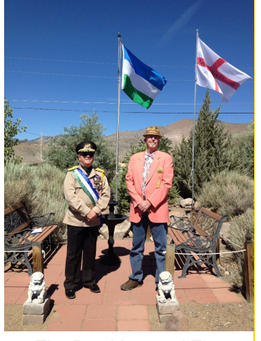
The President and The Governor General in Republic Square