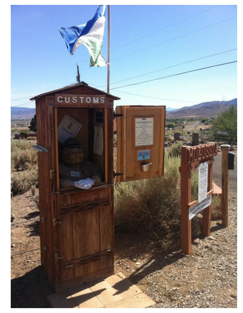
Molossia's Customs Shack in its new location