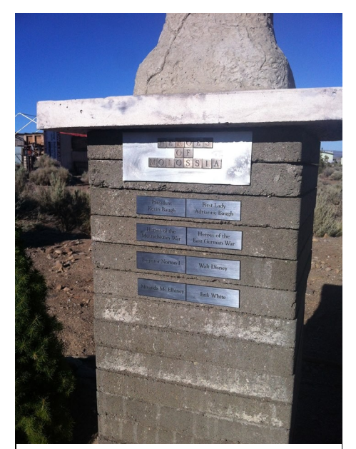
New Plaques on the Molossian Heroes Monument