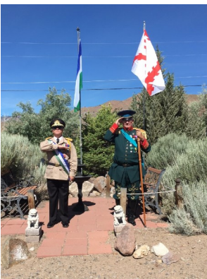
The President and the King in Republic Square