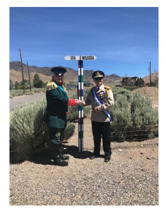
The President and the King at the Border