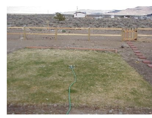
Molossia's Norton Park in 1999 and Today