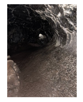
Inside Sunshine Cave