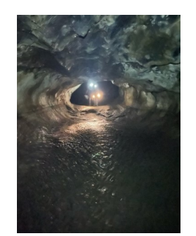
Lave Tube, Valentine Cave