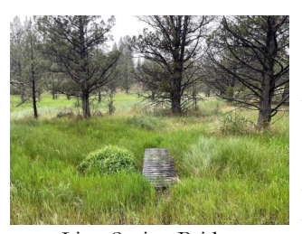
Lion Spring Bridge