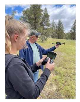
Launching the Drone