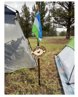
Outpost Molossia Sign