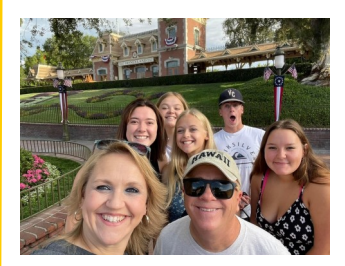
The First Family and Friends at Disneyland!