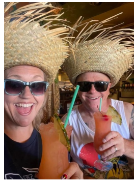
The First Couple Enjoying Themselves at Catalina Island!