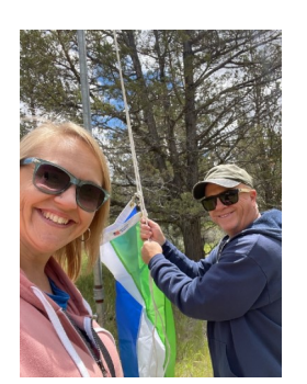
Raising the Flag