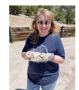
The First Lady's Garnet