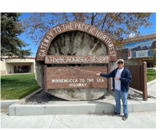
Giant Redwood, Winnemucca