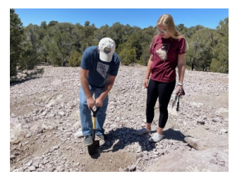
Digging For Garnets