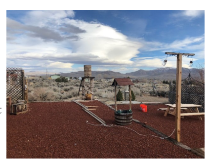
Red Square Damage