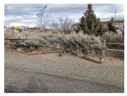
Water Wheel Down