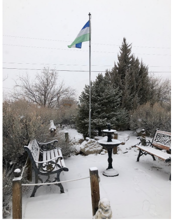
Republic Square, Fourth Storm