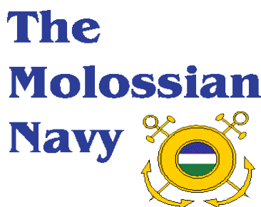
BE A PART!

WWW.MOLOSSIA.ORG/NAVY.INDEX.HTML AND WWW.MOLOSSIA.ORG/MILACADEMY./INDEX.HTML