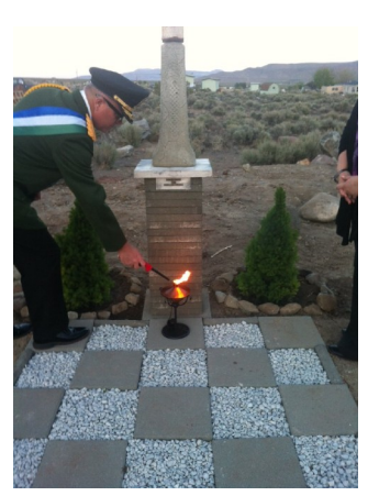
Lighting the Lamp of Honor