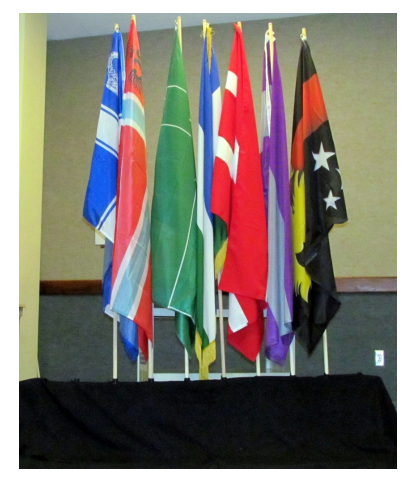
Flags of Nations