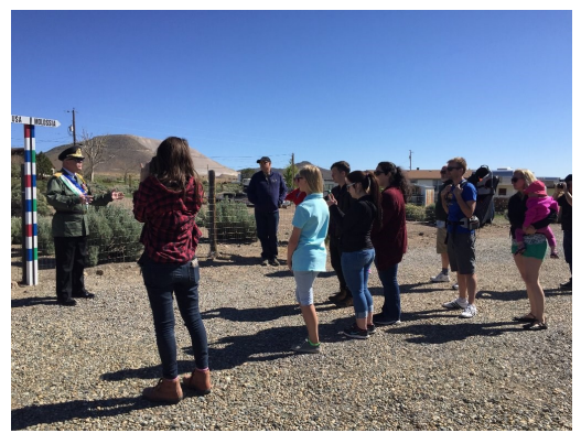
The President Telling All About It.

On 16 April 2016 XXXIX the Republic of Molossia was proud to take part in Obscura Day 2016. Obscura Day is an extension of the website Atlas Obscura, which profiles and highlights unusual places around the world. On Obscura Day people are encouraged to explore unique places near to them, and in the Northern Nevada area the Republic of Molossia is one of those locations. Molossia was a location for Obscura Day 2015 and there was no question that our nation would again be this year. His Excellency, The President is a big fan of Atlas Obscura and again readily volunteered our nation to be an Obscura Day point of interest. Therefore, on a warm Saturday morning we opened our borders to a large group of world explorers - 16 in fact, one of our larger tour groups, and many more than last year's Obscura Day. Among our visitors was no less than the founder of Atlas Obscura himself, Dylan Thuras! Beginning at 10:39 AM MST, His Excellency, The President, The First Lady and the Chief Constable took our Obscura Day guests on a tour of our nation, seeing all the sights and hearing all the tales of Molossia. After wandering our little country for an hour and a half, the group took their leave of Molossia, having had an excellent visit. We are quite proud to have taken part in this year's Obscura Day event and thoroughly enjoyed welcoming our visitors to Molossia. We look forward to Obscura Day 2017 and to more intrepid world explorers visiting our nation!