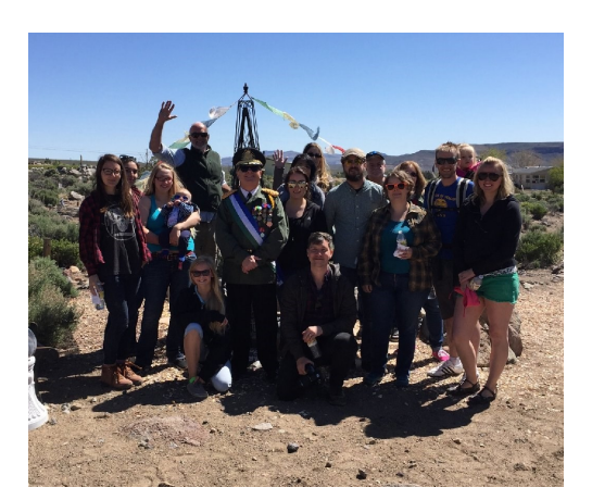
A Great Group Of Obscura Visitors!