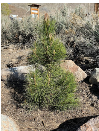
On Earth Day, two new trees planted in Molossia, with another on the way!