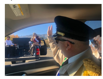
Greetings from Molossia!