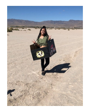
Cassie's Sushi Box