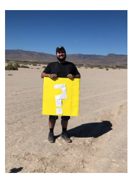
Tony's Mystery Box