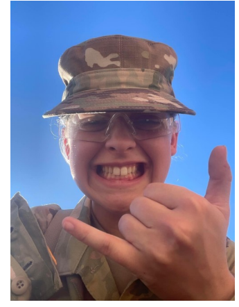
The Chief Constable Keeping a Positive Attitude in Basic Training!