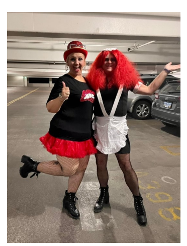
The First Lady and a Friend at the Rocky Horror Picture Show!