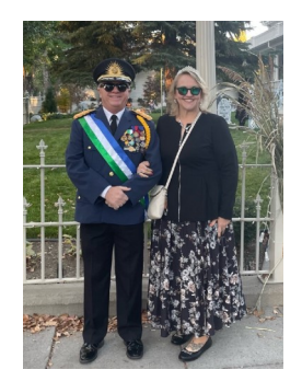
The President and