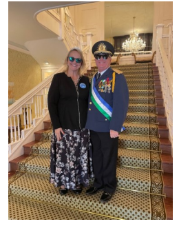
Visiting the Governor's Mansion