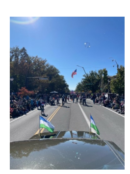
Crowded Parade Route Ahead!