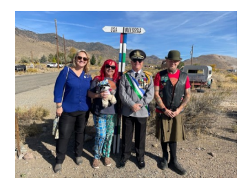
The Guv'na and Guv'ness of DonSam Wadi with The President at the Border