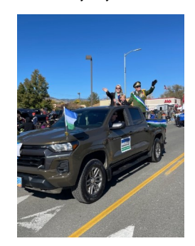
On the Parade Route.