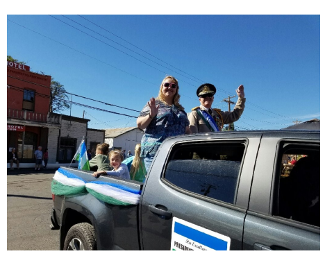
On The Parade Route