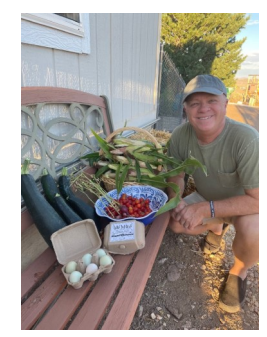
And A Bounty From The Garden.

Molossia is a tiny nation and lacking in resources. As such we have very little to export to support our economy. In fact, the joke in our nation is that our two main exports are our children off to school and trash to the United States. Lately however, with the advent of the Molossia Farm, we finally have true exports. Molossia's chickens produce eggs and as of last week those eggs became the first real export to customers outside of our nation. Along with that we exported corn and zucchini, fresh from Molossia's Victory Garden. Of course the eggs and produce aren't just for export, they feed our nation as well. The tomatoes go into our salads and the zucchini makes a great side dish. And corn from Molossia's cornfield not only became part of our meals but has also been made into delicious cornbread, a wonderful accomplishment indeed. All in all, Molossia's Farm has enhanced our nation, an added element in our ongoing quest for sovereignty and functionality and one that will serve us well for many years!