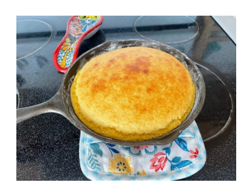
Cornbread, Ready For Eating!