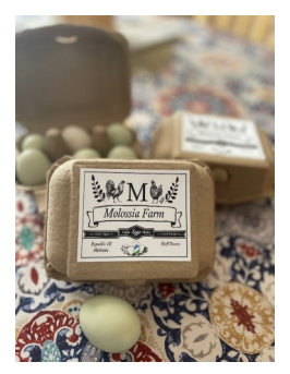
A Bounty Of Eggs.

Molossia is a tiny nation and lacking in resources. As such we have very little to export to support our economy. In fact, the joke in our nation is that our two main exports are our children off to school and trash to the United States. Lately however, with the advent of the Molossia Farm, we finally have true exports. Molossia's chickens produce eggs and as of last week those eggs became the first real export to customers outside of our nation. Along with that we exported corn and zucchini, fresh from Molossia's Victory Garden. Of course the eggs and produce aren't just for export, they feed our nation as well. The tomatoes go into our salads and the zucchini makes a great side dish. And corn from Molossia's cornfield not only became part of our meals but has also been made into delicious cornbread, a wonderful accomplishment indeed. All in all, Molossia's Farm has enhanced our nation, an added element in our ongoing quest for sovereignty and functionality and one that will serve us well for many years!