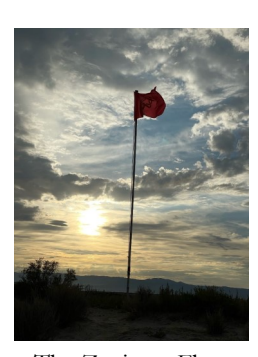
The Zaqistan Flag Against the Desert Sky.