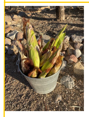
A Bounty Of Corn From Molossia's Cornfield!