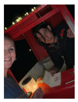
The First Lady Getting Stamped.