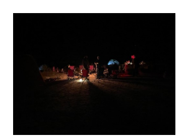
Zaqistan at Night.