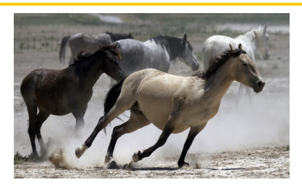
The Mustang, Molossia's National Animal