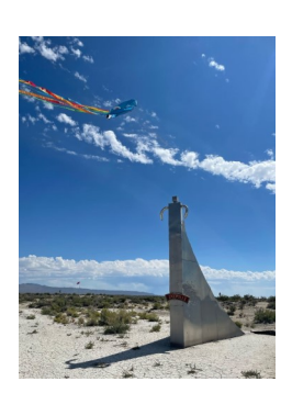
Kite Over the Mon-