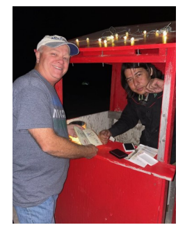
Passport Stamping at the Border