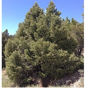
Single Leaf Juniper, Molossia's National Tree