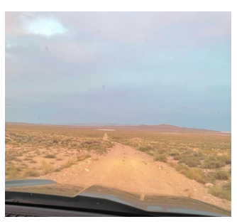
The Road to Zaqistan.

The voyage to Zaqistan was a long one, as the nation is located in the remotest of remote places. The First Couple had to travel all the way across Nevada, to its northeast corner, and then further on into Utah. The final leg of the trip was on dirt roads, winding through empty desert, before eventual arrival at Zaqistan. The President and First Lady were welcomed by a crowd of Zaqistanis, and had their passports stamped by President Landsberg himself at the border. As the arrival was late in the day, the balance of the time was spent around a campfire, discussing micronations and micronationalism, in spirited conversation. The next day, the First Couple arose early and spent several hours helping build robots and installing a weather station to monitor Zaqistani weather. As there are no permanent residents of Zaqistan, monitoring the nation from afar is important. In the afternoon, the President and First Lady eventually took their leave from Zaqistan, bidding a fond farewell to the President and many characters that make up the Zaqistani citizenry. After an overnight stop in Wendover, Nevada, the First Couple returned to Molossia, very satisfied with an historic and entertaining visit to the artistic desert nation of Zaqistan.