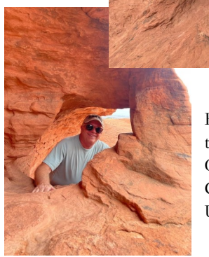
Exploring the Red Cliffs of St. George, Utah!