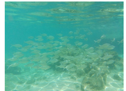
School Of Fish