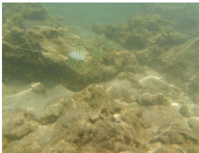
In The Cove