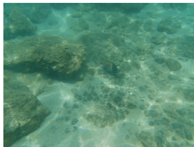
Red Stripe Spotted