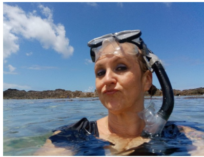
The Other Intrepid Explorer!