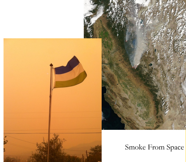
Smoke and Our Flag