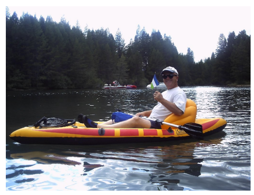
His Excellency, The President Aboard the M.S. Bandicoot