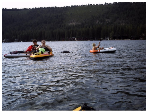
The fleet on Donner Lake