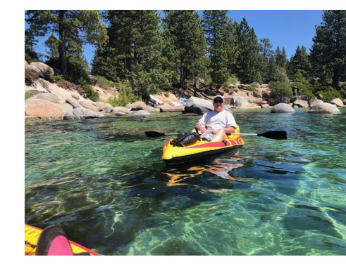
The President On The Nevada Side