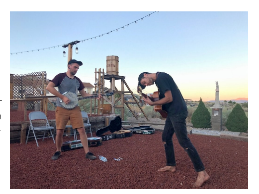
The Band Rocking Out