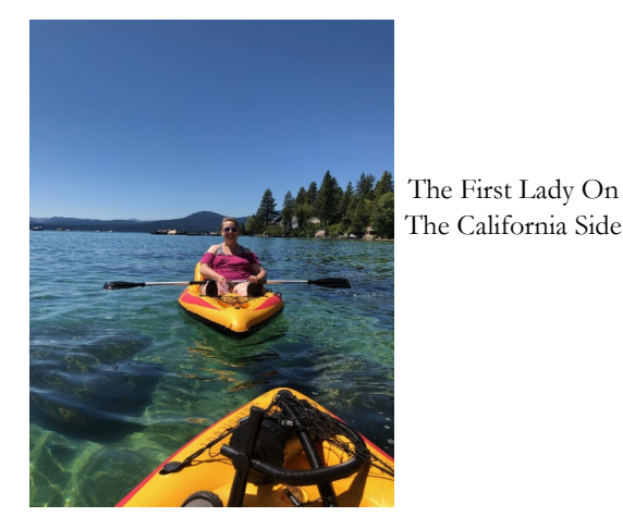
Crossing The Border