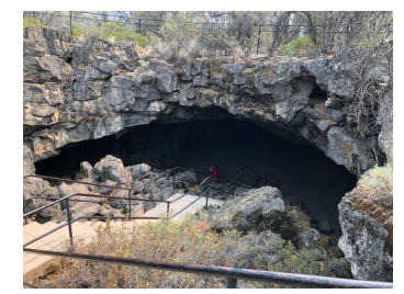
Entrance To Subway Cave