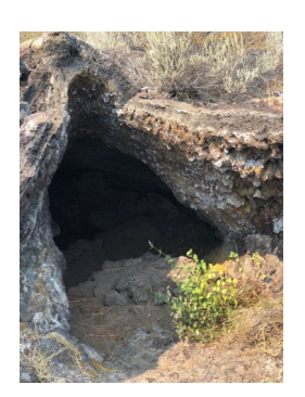
Lava Tube With Lavacicles