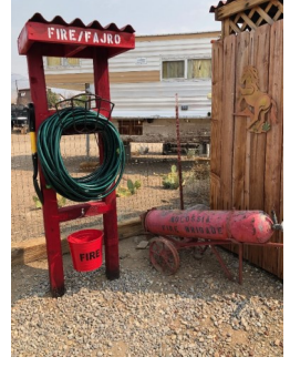
Fire Equipment At The Ready!

Molossia is no stranger to natural disasters. Our desert nation has been lashed by destructive windstorms, swamped by roaring flash floods and even rattled by earthquakes. But one danger that looms over the rest is the threat of wildfire. During the warmer months of the year wildfires rage throughout the western part of North America, causing great destruction. Thousands of hectares of forest and rangeland are burned every year, fires caused by lightning and, unfortunately, man. Here in Molossia over half of the Home Territory is sagebrush desert, particularly susceptible to fire. We are always cautious to avoid any activity that might cause fires and to take precautions to prevent fires from happening at all. One measure that has recently been implemented by Molossia's Directorate of Emergency Management is our new fire prevention stand. Located adjacent to Red Square, the fire stand includes hoses, a shovel and sand bucket, all ready to be used to suppress any fire within our nation. With this new equipment we are now prepared to stop wildfires in their tracks and keep our nation safe from at least this form of disaster!